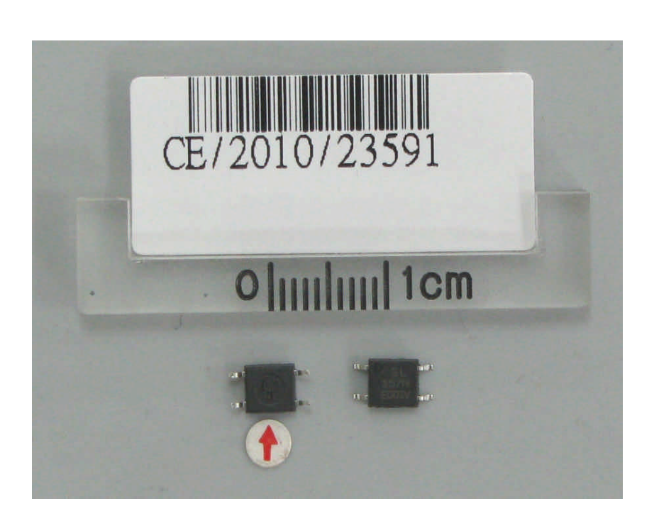
** 報告結尾 (End of Report) **

Unless otherwise stated the results shown in this test report refer only to the sample(s) tested. This test report cannot be reproduced, except in full, without prior written permission of the Company. 除非另有說明,此報告結果僅對測試之樣品負責。本報告未經本公司書面許可,不可部分複製。